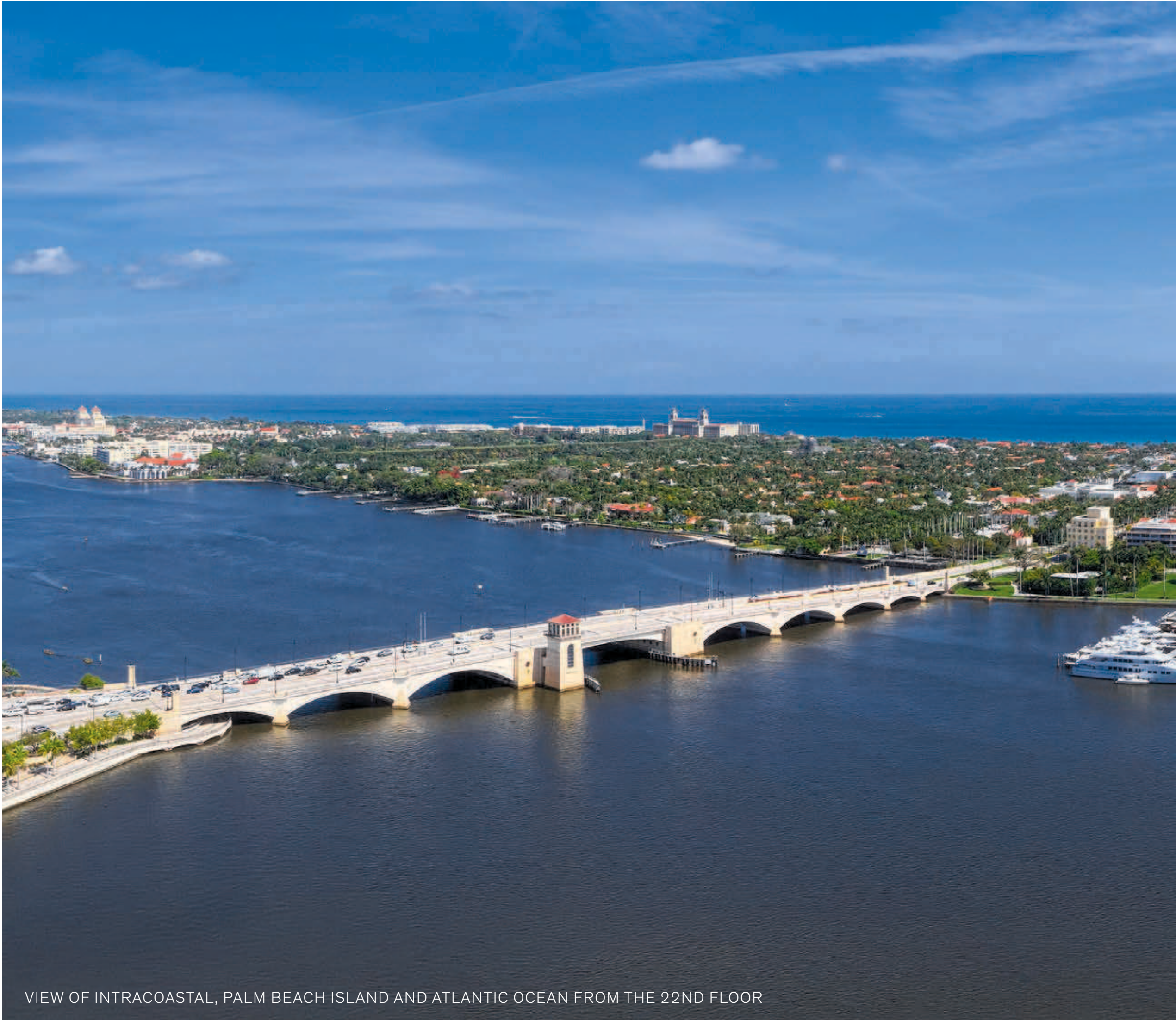
VIEW OF INTRACOASTAL, PALM BEACH ISLAND AND ATLANTIC OCEAN FROM THE 22ND FLOOR